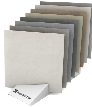
METAL RAMP DIAGONAL