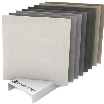
METAL FLAT DIAGONAL